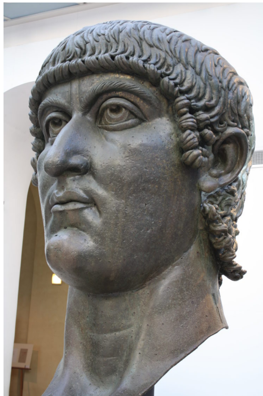
A 4th-century head of Constantine, which clearly shows not only the degenerate appearance of its subject, but also the decline of Classical art that had already taken place.

In 313, Constantine and his colleague, Licinius, who were jointly fighting civil wars against rival emperors, issued the so-called Edict of Milan, which proclaimed universal toleration for all religious cults and specifically named the Christians as cults to be tolerated. The two emperors undoubtedly felt that the support of the Christian organisations would be an asset in the civil wars, and Constantine may have foreseen that they could be especially useful to him when the time came for him to turn upon and destroy his ally and brother-in-law, Licinius. Of course, as soon as Constantine was safely dead, the Fathers of the Church concocted a story that he had been privately "converted" by a childishy-imagined miracle in 312, and had been actually baptised on his death bed, so that the soul of one of the most treacherous rulers undoubtedly flitted right up to Jesus.