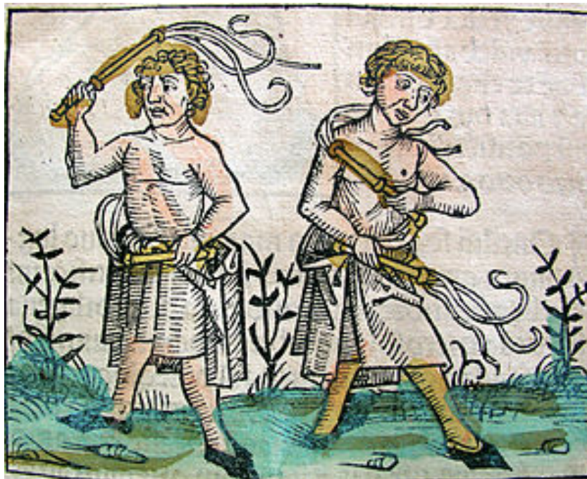
The Christian tendency to devalue the body, exemplified here by medieval “flagellants” who whipped themselves bloody, is the opposite of the natural European Attitude toward our physical being, which we can see expressed in the great works of Arno Breker, Praxiteles, and many others.

From this notion, corrupted by the addition of some of the sexual obsessions that seem to be an innate part of the Jews’ racial mentality, Christianity proclaimed the doctrine of race suicide for our people. Allowance was made, of course, for the men who did not have the fortitude to castrate themselves or otherwise frustrate the instincts of healthy men, but by a monstrously obscene