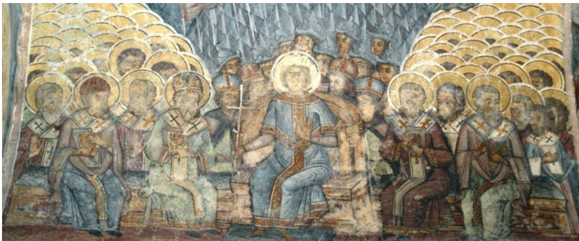
A Christian artist's conception of the Council of Nicaea in 325 AD, which had secured the official endorsement of Roman Emperor Constantine, and which served to marginalize the many Christian sects (and their innumerable gospels) which had been competing with the “Fathers of the Church” — and set the stage for their persecution.

From such compositions, the Fathers of the Church collected and selected their favourites, making such revisions as they deemed expedient and probably composing supplements. These they eventually put together into a small anthology, which they called a “New Testament” and thus indissolubly joined to the Jews’ story book, which they called an “Old Testament.” The final selection of pieces for the anthology is said to have been made in 367 by Athanasius, a particularly bull-headed holy man, who is still revered for his services in establishing the incomprehensible doctrine of a three-in-one-god, of which Jesus was 33%. His authority made it thenceforth impossible to compose new gospels with any chance of implanting them in the canon he had established. Thereafter, revision of the stories about Jesus was limited to short interpolations and verbal substitutions.