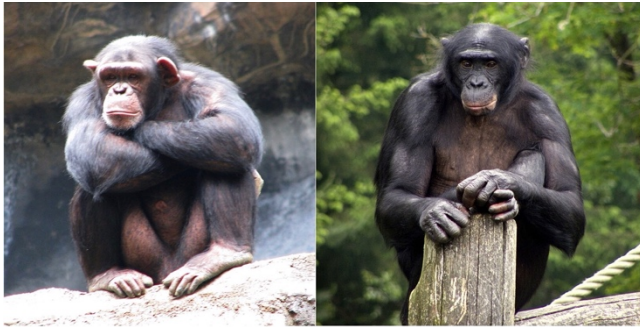
Male chimp on the left, male bonobo on the right.

In bonobo society, such competition doesn't exist. Bonobos are egalitarian and gynocentric. What the female zoologist said above is false because among bonobos violence comes from females. They unite and attack the male by biting his fingers and even his penis. Chimpanzees may beat and rape females, but they don't dismember them. In bonobo society, females even mate with weaker males because they are easier to control and bite those who resist their Diktat . Because of this sexual selection, male bonobos eventually shrunk anatomically over the generations. The vlogger says that if chimpanzees were confronted with male bonobos, the former would kill them all, and the females' trick of trying to bite wouldn't work. He adds a picture showing how the male chimp is anatomically more robust than the male bonobo.